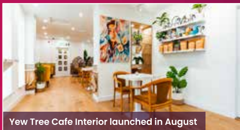
Yew Tree Cafe Interior launched in August