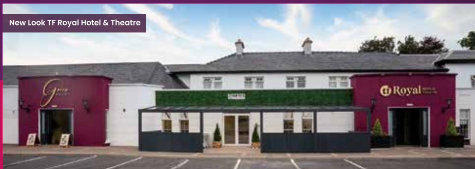
New Look TF Royal Hotel & Theatre