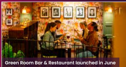
Green Room Bar & Restaurant launched in June