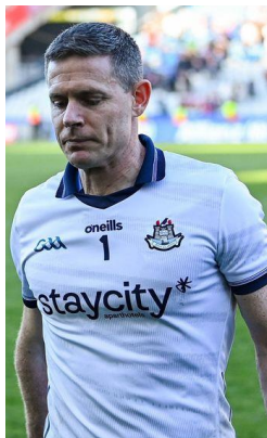
Stephen Cluxton (Dublin)