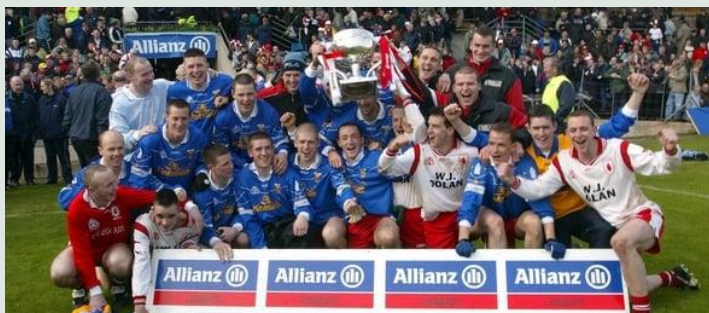
Tyrone – Allianz Football League Division 1 Winners 2002 – Their First League Title.