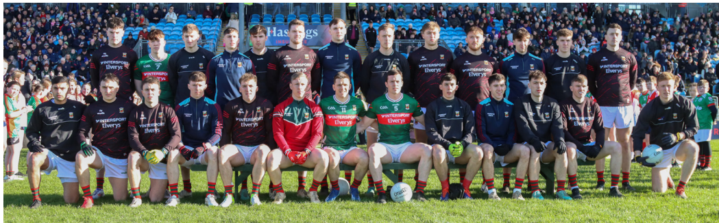
Mayo v Galway, Allianz Football League, 2nd February 2025